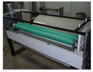
FTS 3000 BR Corona Treaters