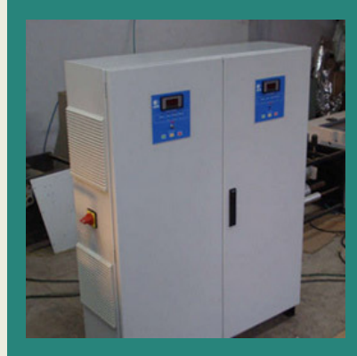
FTS 8000 Series Corona Treater