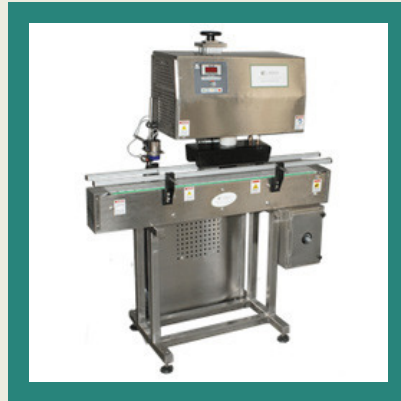
Aurac II C Induction Cap Sealing