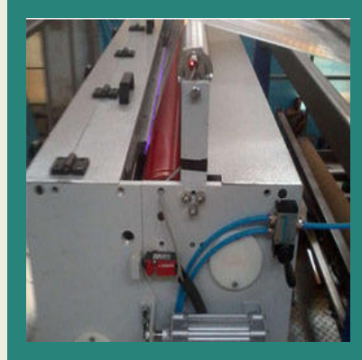
FTS 6000 Series Corona Treater