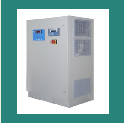
FTS 3000 (Printing) Corona Treater