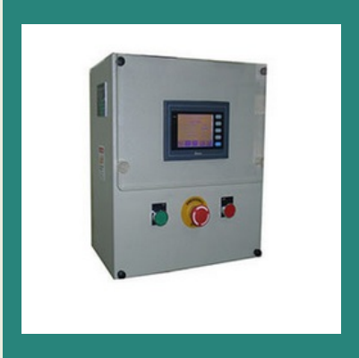
Autosafe PLC Unit