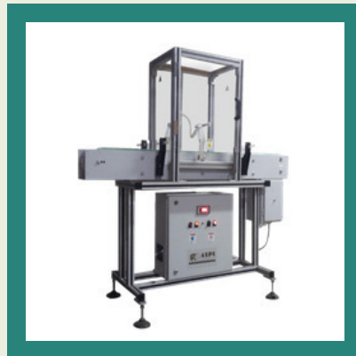
FTS 500 3D Corona Treater