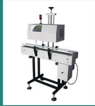
Air Cooled Induction Cap Sealing Machine