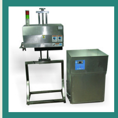
AURAE III - SS Induction Cap Sealing Machine