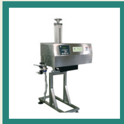
BREZO A - SS Induction Cap Sealing Machine