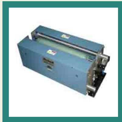
Non Conductive Film Corona Treater