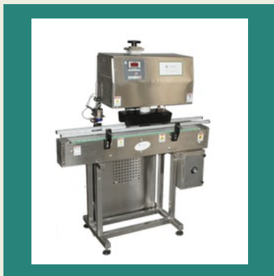
Induction Cap Sealing Machine