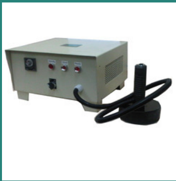
BREZO P Induction Cap Sealing Machine