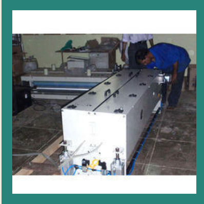
FTS 5000 BR Corona Treater