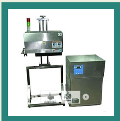
Induction Cap Sealing Machine