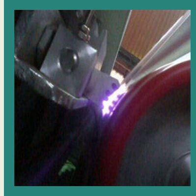
FTS 7000 Series Corona Treater