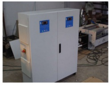
FTS 8000 Series Corona Treater