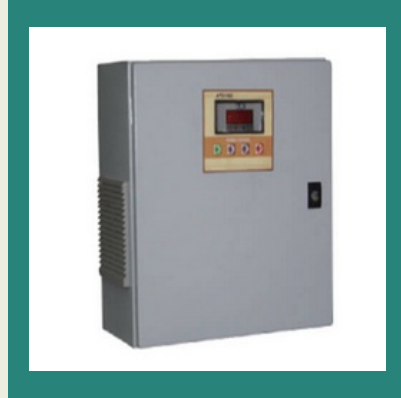
FTS 1000 (Printing) Corona Treater