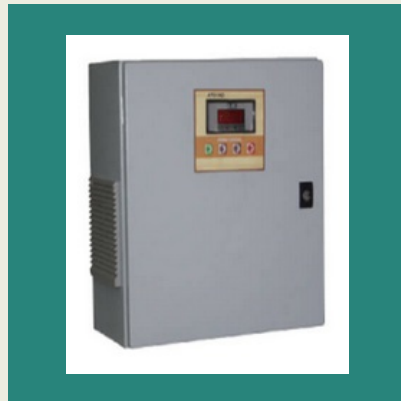
FTS 750 (Printing) Corona Treater