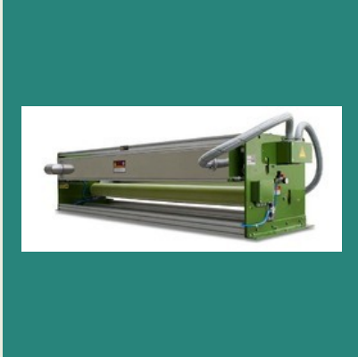
Blown Film Corona Treater