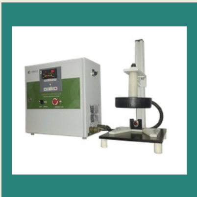
Induction Cap Sealing Machine