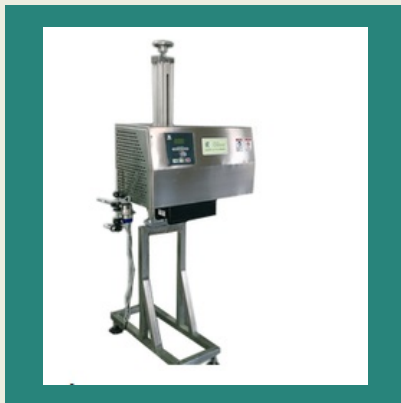
Induction Cap Sealing Machine