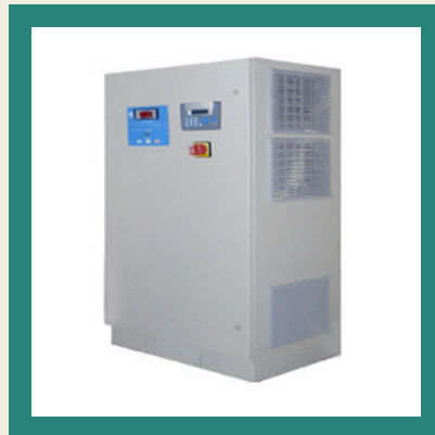
FTS 3000(Printing) Corona Treater