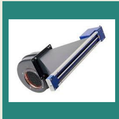
Ionising Air Blowers