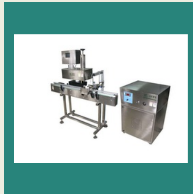
Induction Cap Sealing Machine