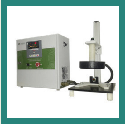
Arshad Fluxosealer Brezo