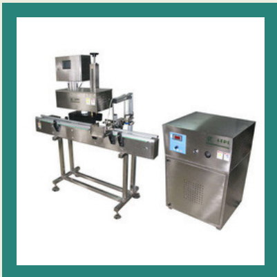
Aurac III C Induction Cap Sealing