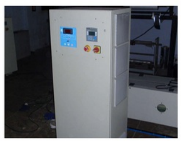
FTS 5000 Series Corona Treaters