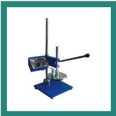
Manual Sealing Machine