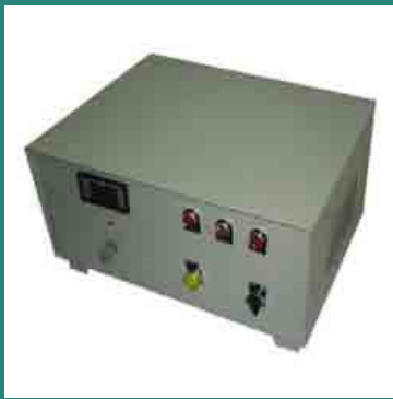
Corona Treatment Machine for Blown Film