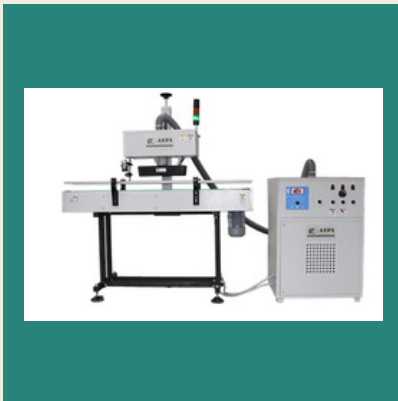
Induction Cap Sealing Machine