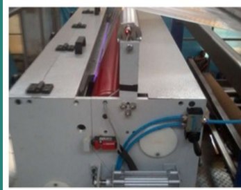
FTS 6000 Series Corona Treater