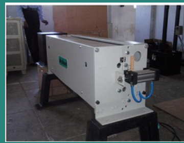
FTS 650 (Printing) Corona Treaters