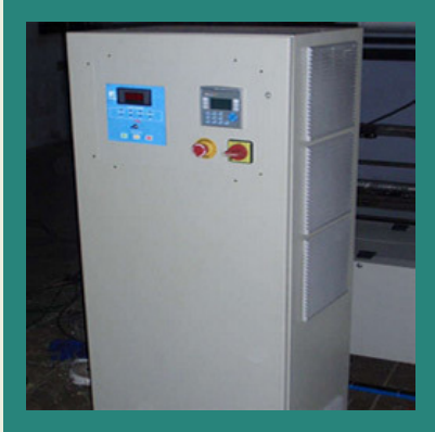
FTS 5000 Series Corona Treater