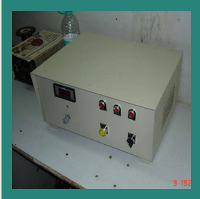
FTS 500(Printing) Corona Treater