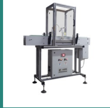
FTS 500 3D Corona Treaters