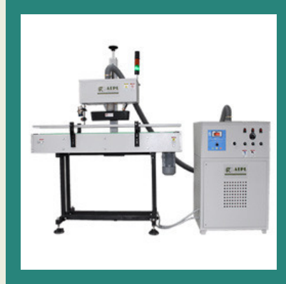
Aurac II C FLP Induction Cap Sealing