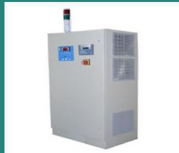
Corona Treatment Machine for Coating & Lamination