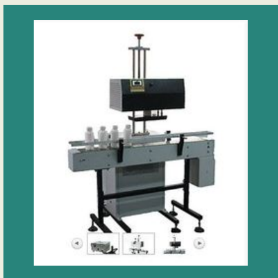
Induction Cap Sealing Machine