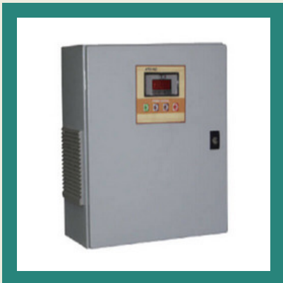
FTS 750(Printing) Corona Treater