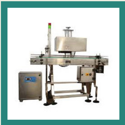
AURA II- MS Induction Cap Sealing Machine