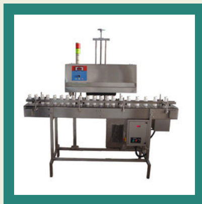
Induction Cap Sealing Machine