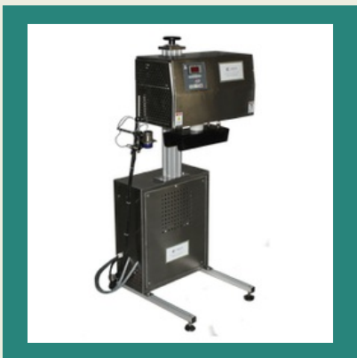
Induction Cap Sealing Machine