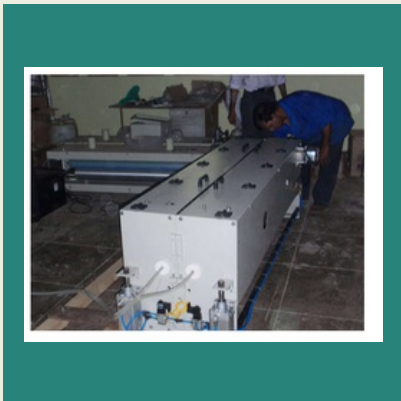
FTS 5000 BR Corona Treater