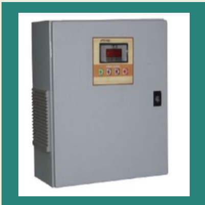
Monolayer Corona Treater