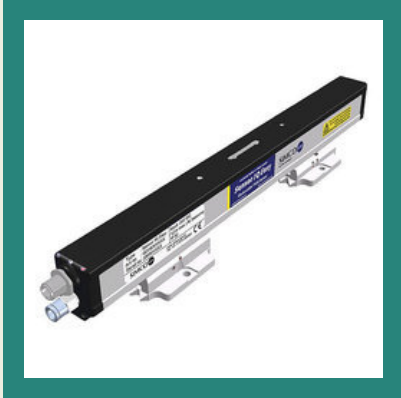
Sensor IQ Easy