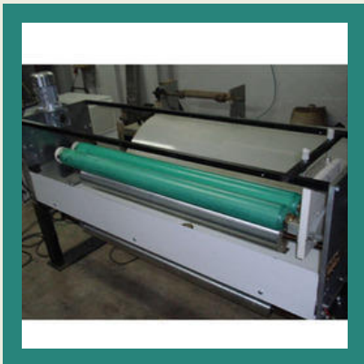
FTS 3000 BR Corona Treater