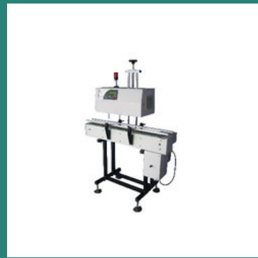
Brezo W-SS Induction Cap Sealing Machine