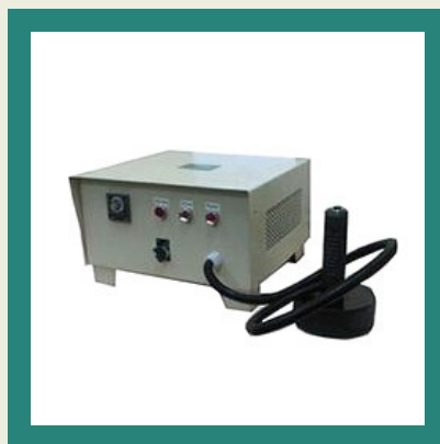
Portable Cap Sealing Machine